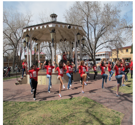
(UNM Flash Mob)

Due to the recent budget costs across the country, our goal was to educate the community and lawmakers about the importance of maintaining poison centers. By partnering with New Mexico State University we were able to conduct awareness activities around the state. In addition to handing out poison center brochures and magnets, we chose two public areas to conduct flash mobs. A choreographed dance was created and posted on YouTube prior to the event. On the day of the flash mobs, participants casually gathered in a common area. When the music started playing, the participants removed their sweaters to reveal red shirts that read “Every 8 Seconds” and joined in the flash mob dance. We used “Every 8 Seconds” on the shirts to signify how often someone is in need of a poison center. The shirts also act as long term advertisement for poison centers.